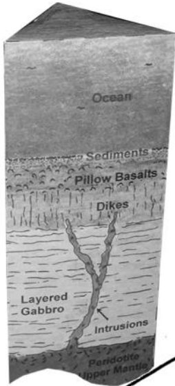
Image of completed model